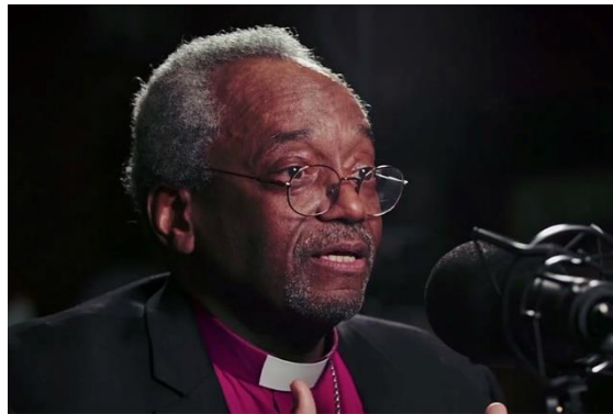
Presiding Bishop Michael Curry.

“The way of Jesus is the Way of Love. And the Way of Love can change the world,” says our Presiding Bishop Michael Curry. Though this phrase is often quoted in relation to our Presiding Bishop, I am certain that this same message, maybe even the exact same words, has been spoken by countless people for two thousand years.