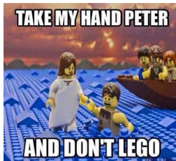
Origination of picture is unknown

Bishop Curry recites inspiring lyrics from one of his favorite Gospel hymns: 'I got my hand on the Gospel plow. Wouldn't take nothin' for my journey now. Keep your eyes on the prize. Hold on, hold on. Keep your eyes on the prize. Hold on... ' Even when uncertainty and ambiguity surround us like a storm, Bishop Curry reminds us of the significance of what it means to abide in Jesus.